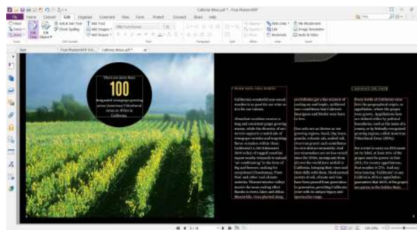
Edit content and layout like a word processor