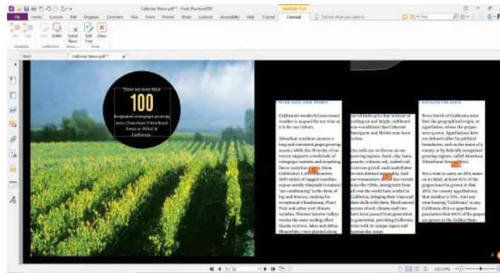
Link text boxes together so edited text reflows between columns.