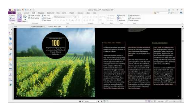
Edit content and layout like a word processor