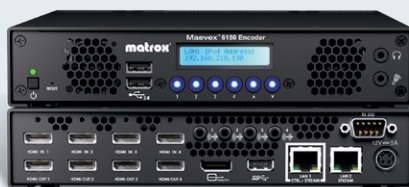
Matrox Maevex 6150 quad 4K encoder appliance (front & back view)