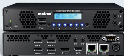
Matrox Maevex 6120 dual 4K encoder appliance (front & back view)

The Maevex 6100 Series is available as system-independent, standalone encoder appliances (Maevex 6150 quad and 6120 dual), as well as a single-slot, high-density PCIe x16 quad encoder card (Maevex 6100).