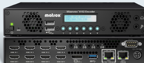
Matrox Maevox 6152 quad 4K encoder appliance (front & back view)