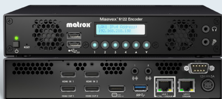
Matrox Maevox 6122 dual 4K encoder appliance (front & back view)