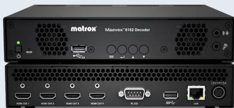
Matrox MaeveX 6152 quad 4K decoder appliance (front & back view)